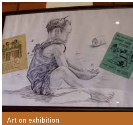
Art on exhibition