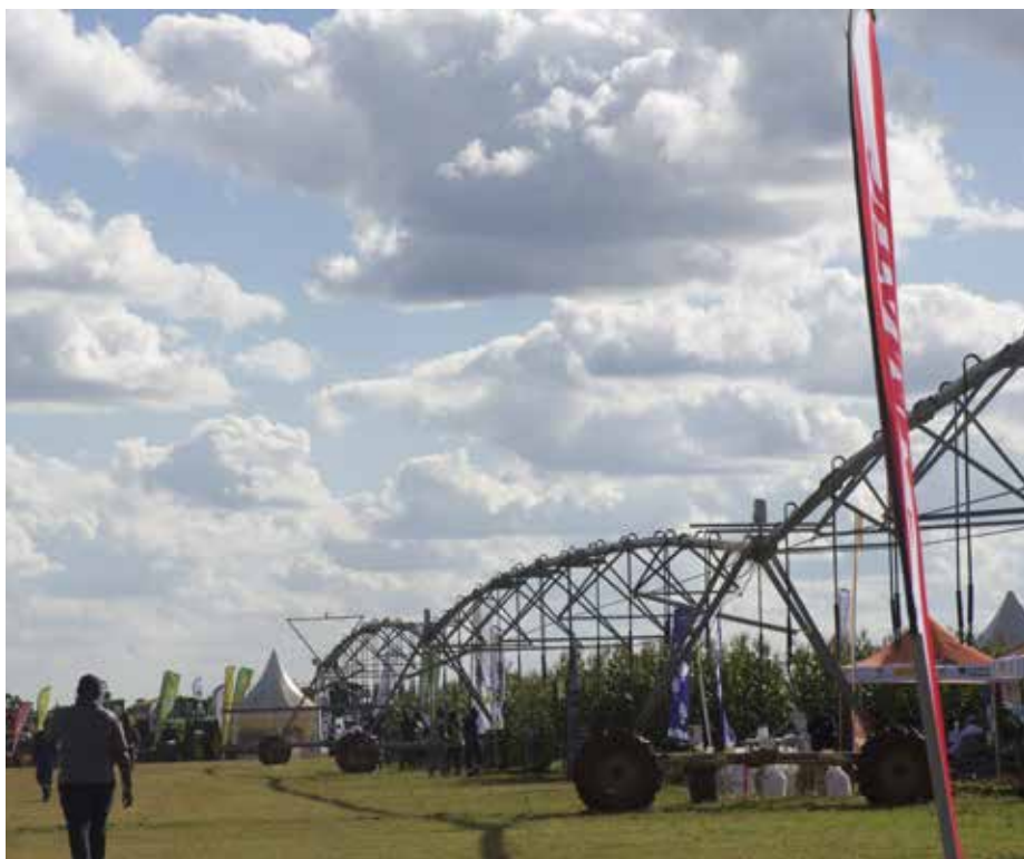
Exhibitors at the 2023 AgricTech Expo