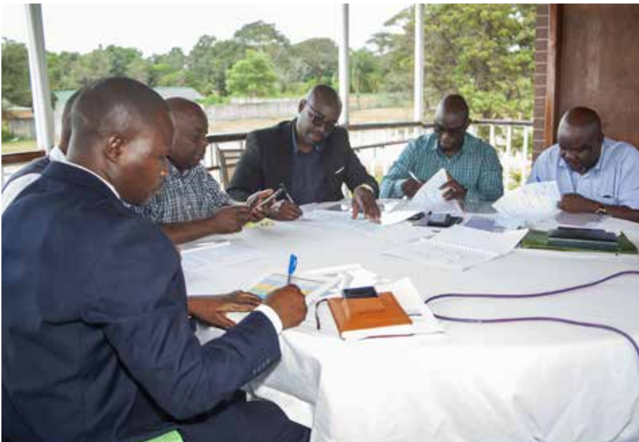
Mine Workers Union Representatives

T he Mine Workers Union of Zambia (MUZ) and the National Union of Miners and Allied Workers (NUMAW) signed the agreement with Grizzly Group on a boat cruise on Makoma Dam in Kalulushi. The MoU covers the period from April 1, 2023, to April 1, 2025.