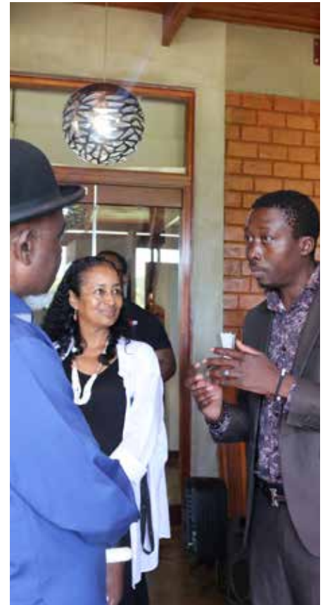
One of the exhibiting artists sharing information during the Art exhibition

"I want to appreciate what Kansanshi and First Quantum are doing in raising this portfolio which time and again goes unnoticed. I see a lot of history being depicted through art. These young artists we see are self-employed, and Kansan-