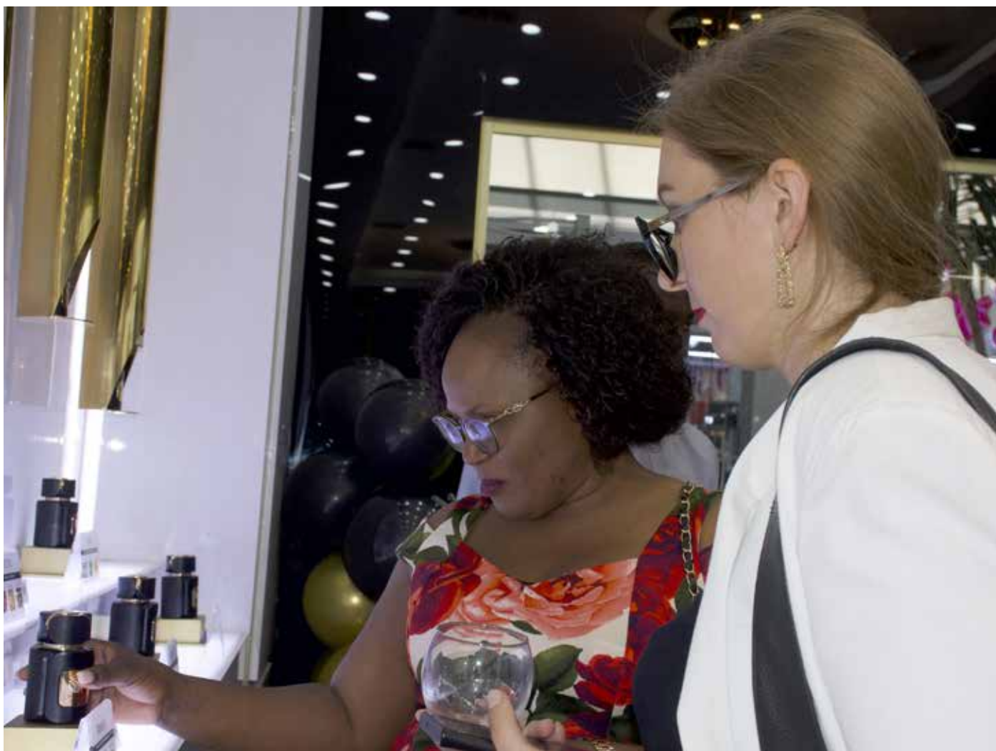
Clients through the Swiss Arabian store during the 1st anniversary commemoration event held at its outlet at the East Park mall in Lusaka