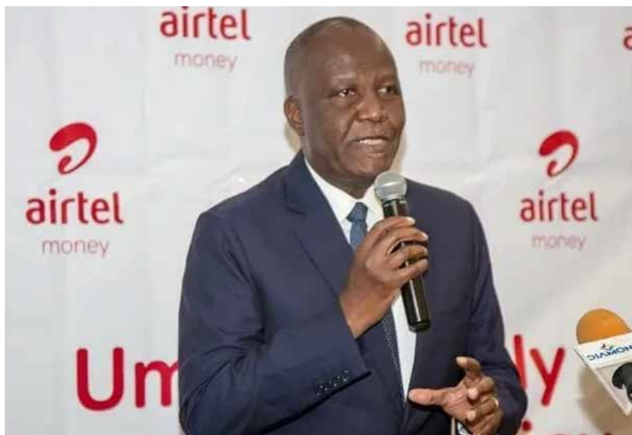
Minister of Technology and Science Hon. Felix Mutati

Absa Life Zambia and Airtel Mobile Commerce Ltd (Airtel Money) have unveiled a digital funeral insurance cover.