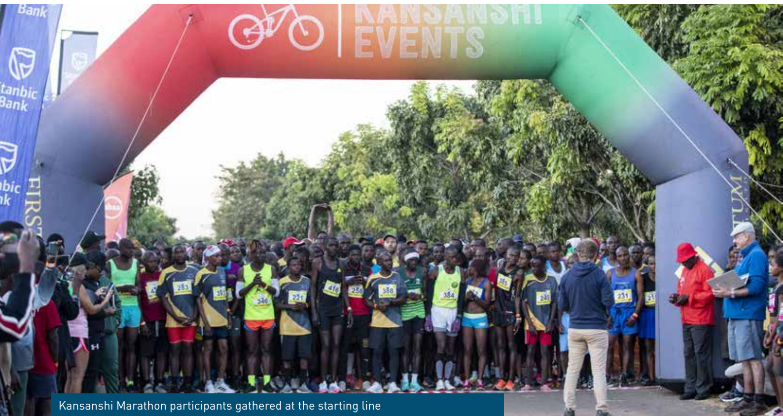
Kansanshi Marathon participants gathered at the starting line

The inaugural Kansanshi Marathon attracted 1000 runners from Kenya, South Africa, and Zimbabwe who filled the 42 km route of Solwezi in North-Western Province.