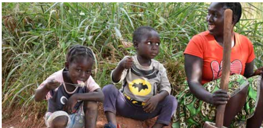
Children jiggle their taste buds with a nutritious organic meal at Kanzala rural health centre.

ment area alone, more than 3,600 residents have benefited from FQM's health outreach programmes such as malaria prevention, screening and treatment through laboratory and sensitization services.