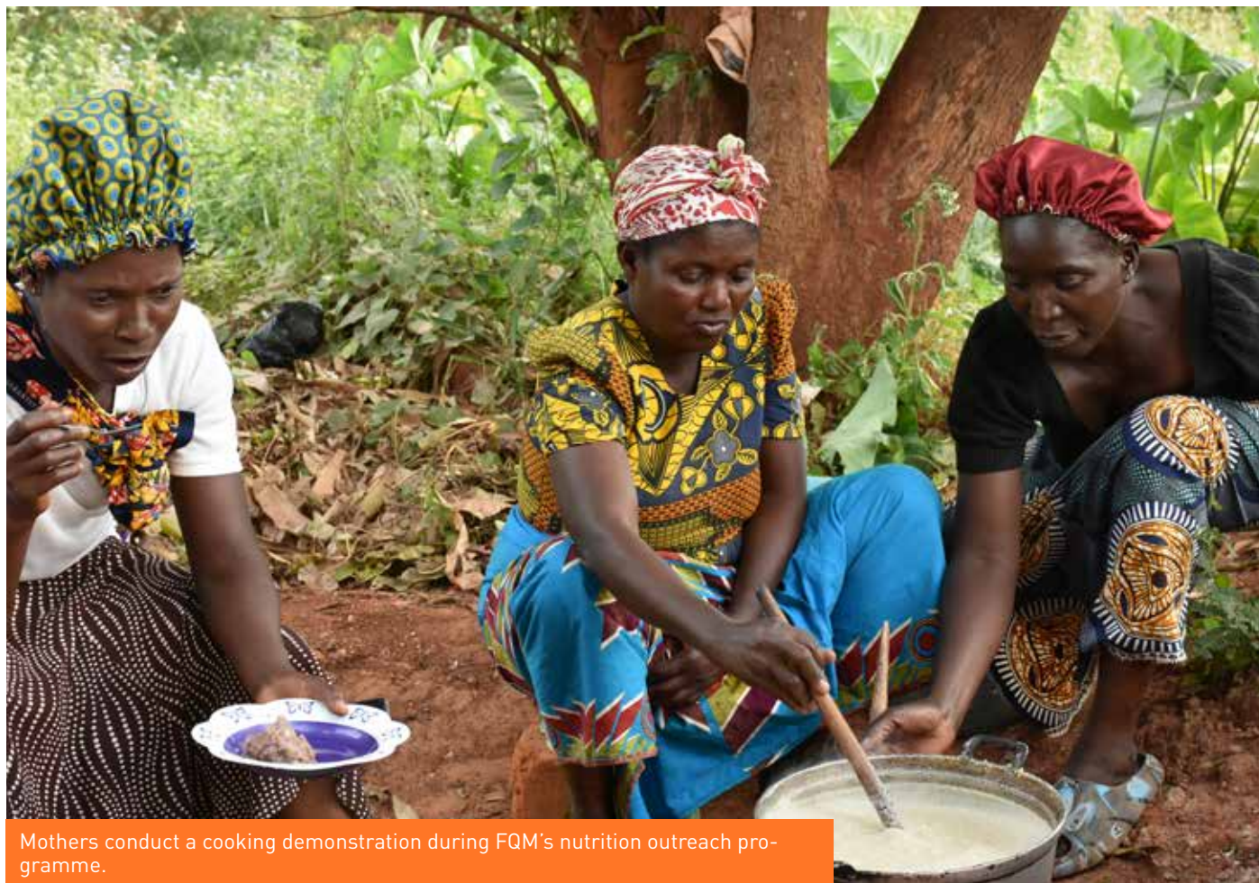
Mothers conduct a cooking demonstration during FQM's nutrition outreach programme.

First Quantum Minerals (FQM) has launched a community programme to improve health and wellness through indigenous natural foods in rural Solwezi and Kalumbila communities.