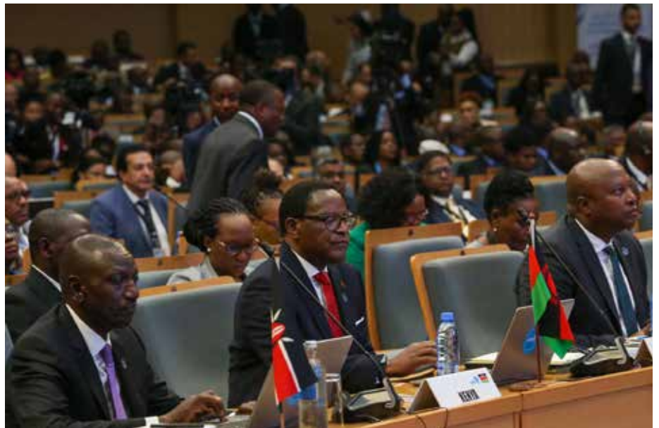
President of the Republic of Malawi Lazarus McCarthy Chakwera (middle) with his Kenyan counterpart Dr William Samoei Ruto (Left) during the recently held 22nd COMESA Summit in Lusaka