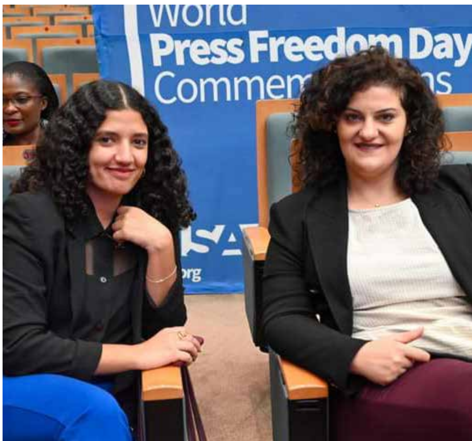
Some of the Journalists captured at the AMC during the official opening by Zambia's Minister of Information and Media.