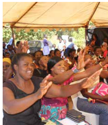
Parents celebrate during the handover ceremony.