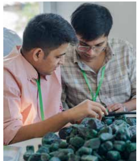
Buyers examining the emeralds at the auction

these minerals themselves thereby not only saving us a lot of freight costs but also bringing in foreign exchange," Ba said.