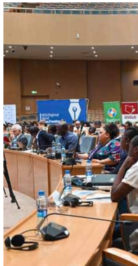
Part of the audience at the AMC following processing.

tries and institutions that promoted freedom of expression as provided for in various African Union human rights instruments.